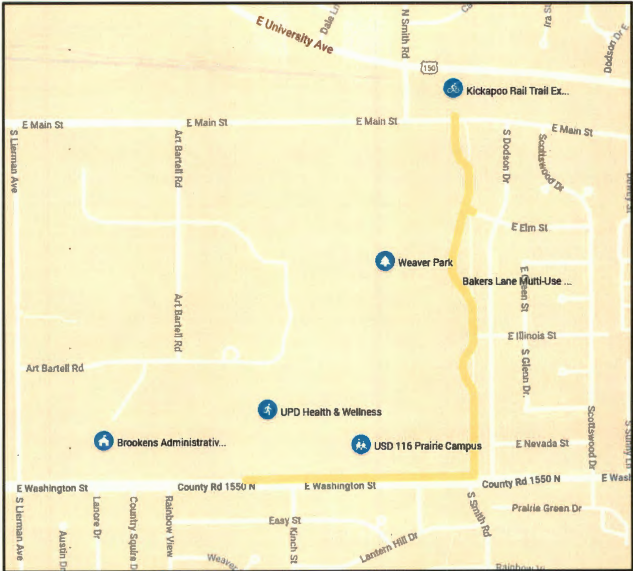
Location Map – Bakers Lane Multi-Use Path (Google My Maps)

ADMINISTRATION • ARBOR • ENGINEERING • ENVIRONMENTAL MANAGEMENT EQUIPMENT SERVICES • OPERATIONS • PUBLIC FACILITIES