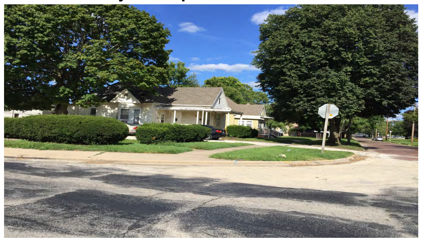
Exhibit E: Subject Properties' Site Pictures