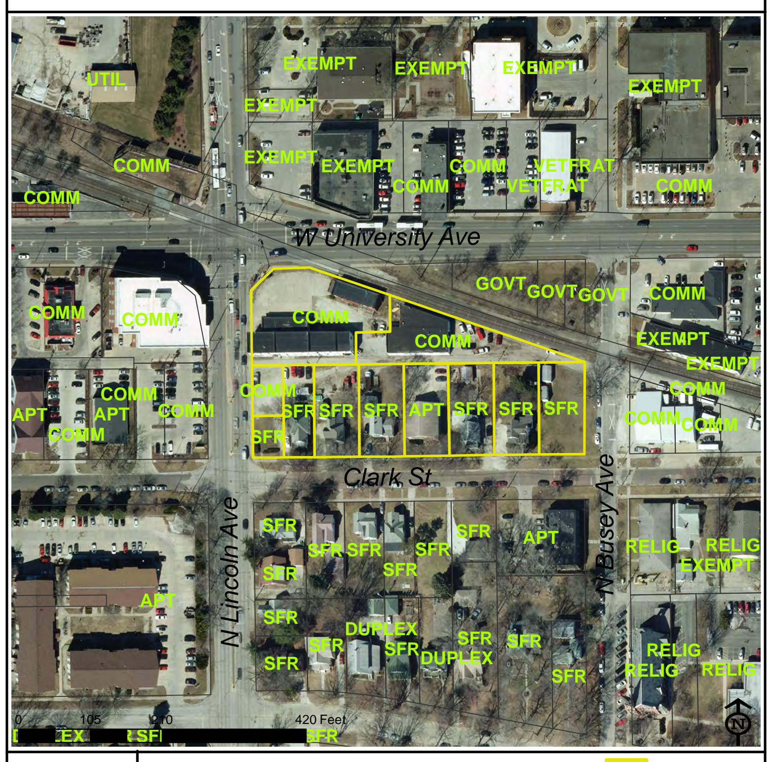
Exhibit A: Location & Existing Land Use Map