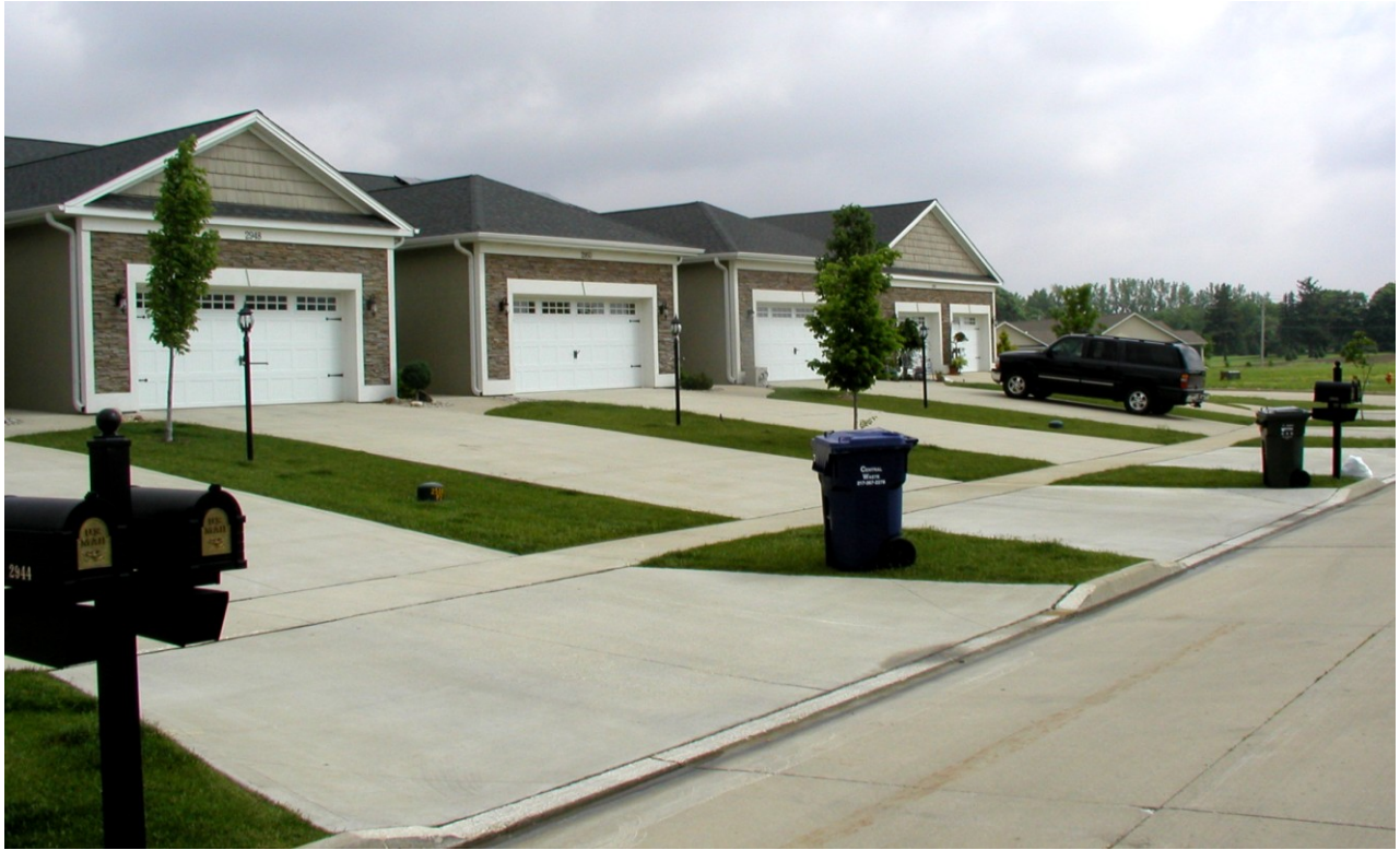
Figure 3: Exterior of a typical townhouse development