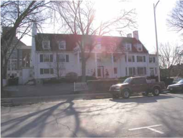
1207 W. Nevada