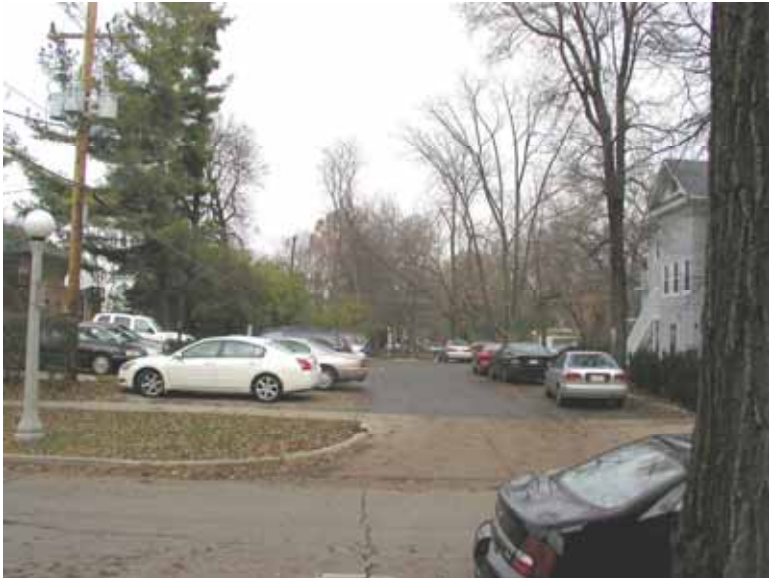
808 W. Ohio