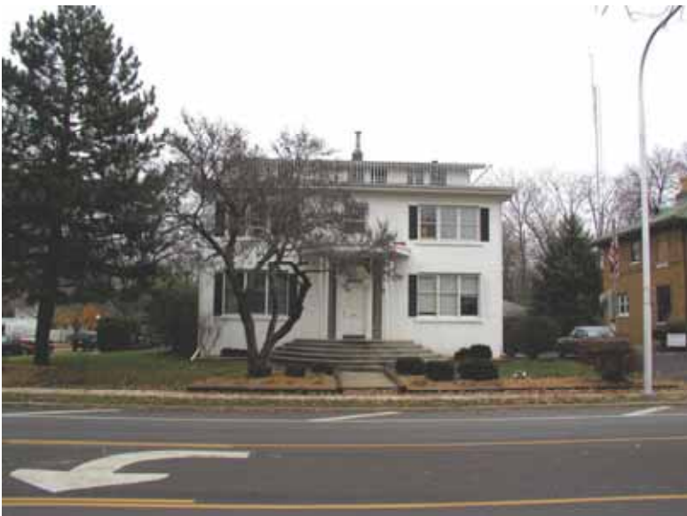
1002 S. Lincoln