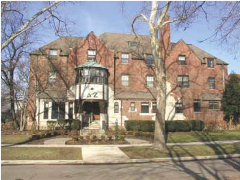
710 W. Ohio