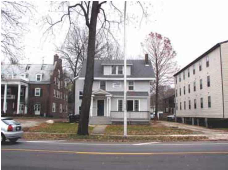
908 S. Lincoln