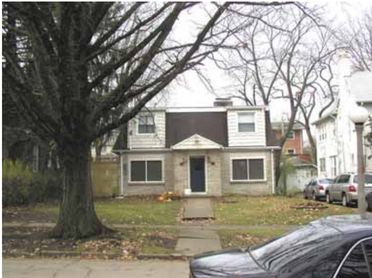
1103 S. Busey