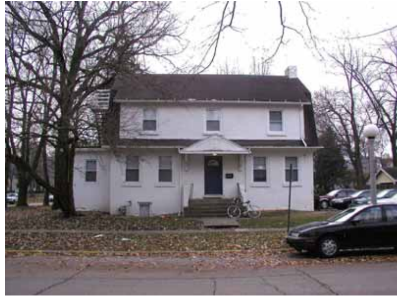
801 W. Iowa