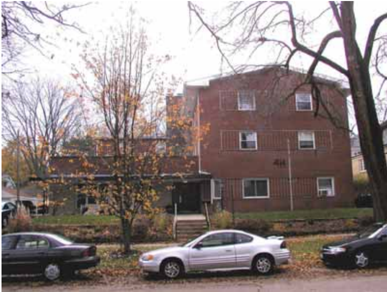
805 W. Ohio.