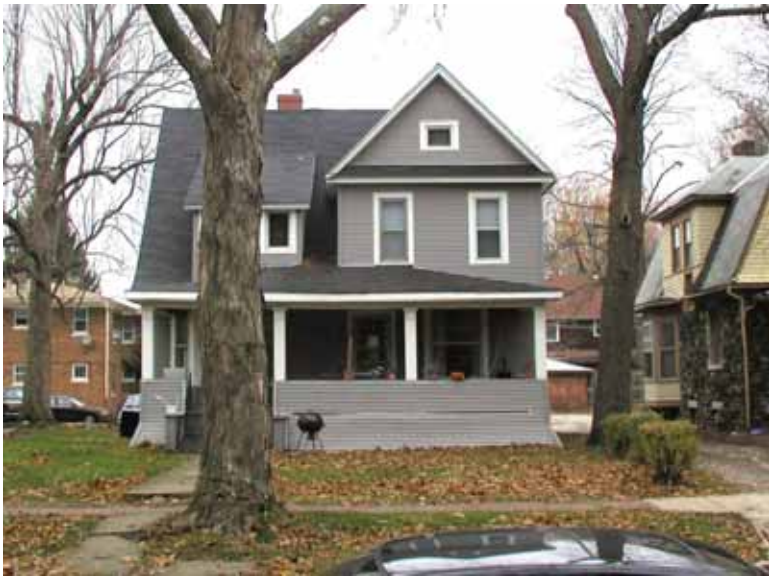
808 W. Oregon