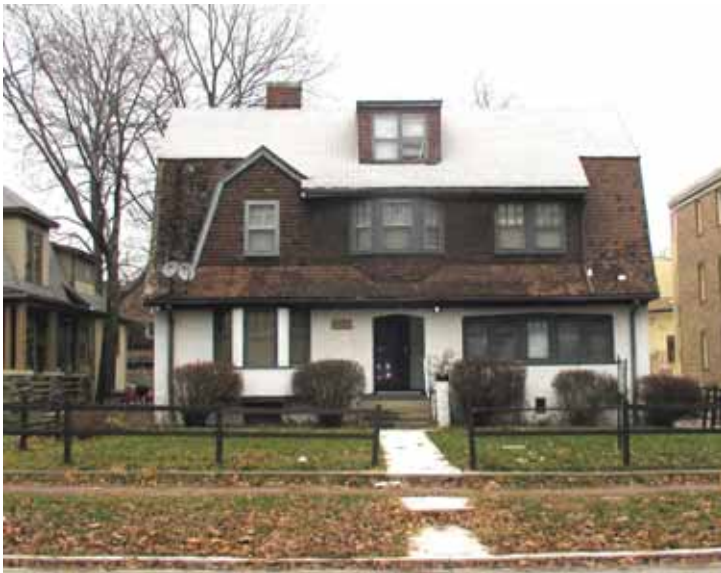
804 W. Oregon