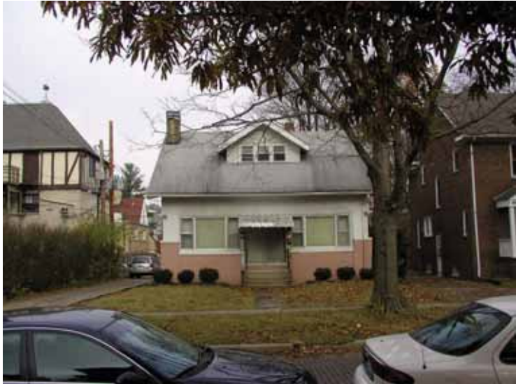
808 W. Indiana