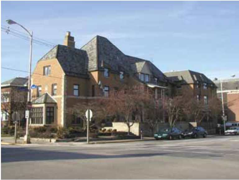
1202 W. Nevada