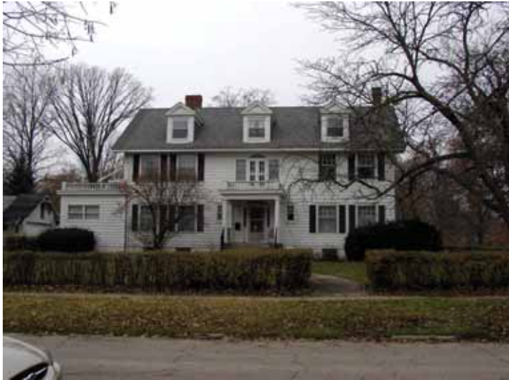
1301 S. Busey