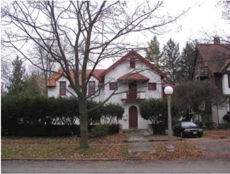
801 W. Oregon