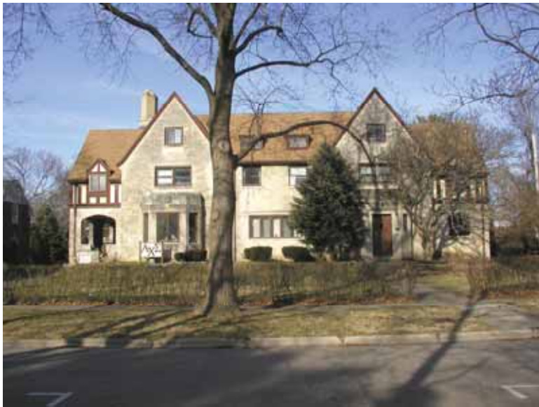
606 W. Ohio