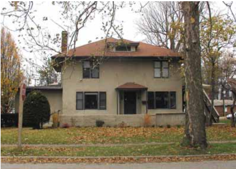
810 W. Oregon