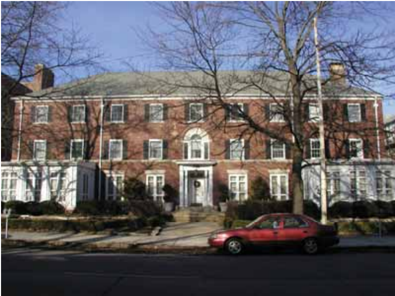
1110 W. Nevada