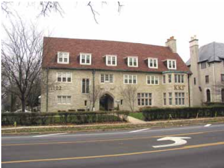
1102 S. Lincoln