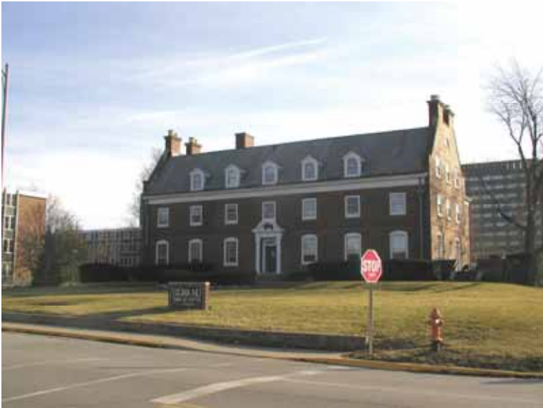
1009 W. Pennsylvania