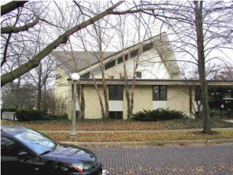
810 W. Michigan