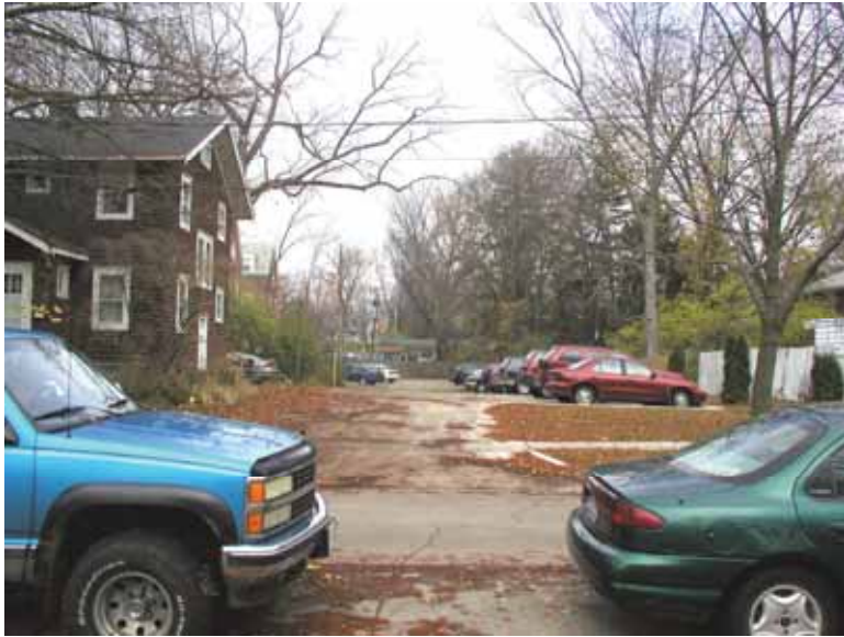
806 W. Iowa