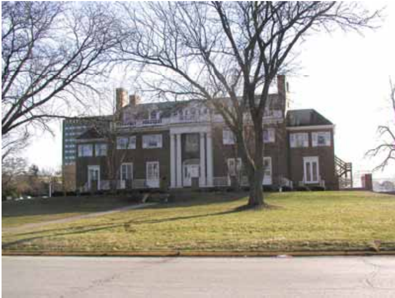
1101 W. Pennsylvania