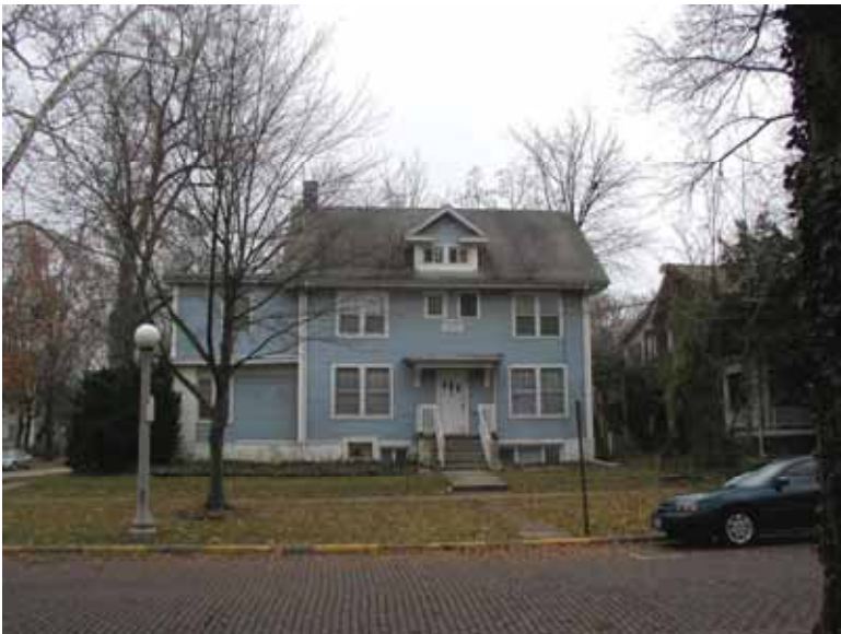
801 W. Nevada