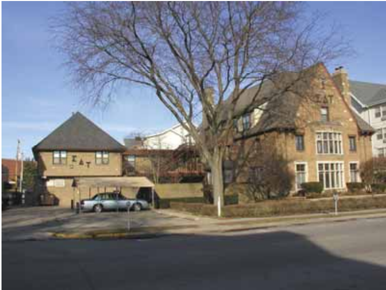
1104 & 1104 1/2 W. Nevada