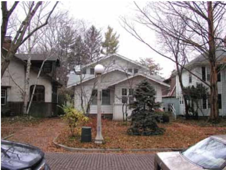
807 W. Nevada.