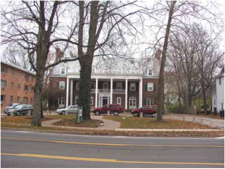
904 S. Lincoln