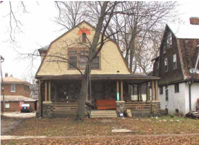
806 W. Oregon