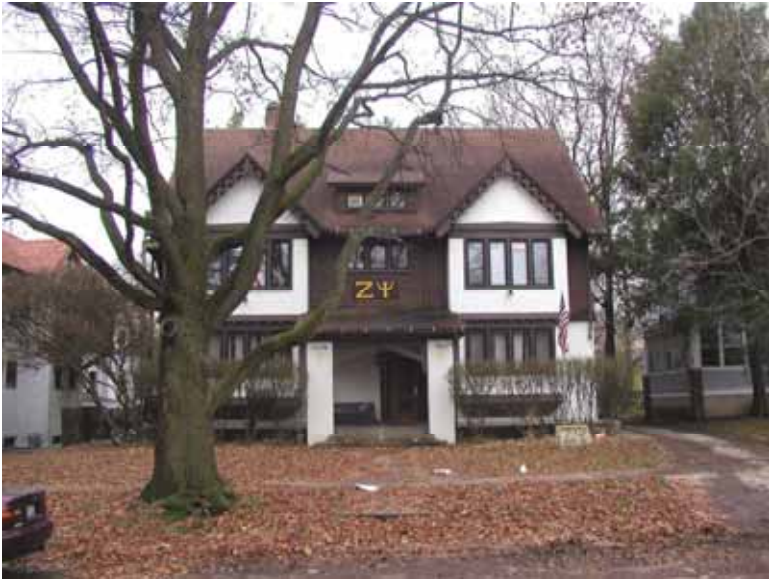
803 W. Oregon