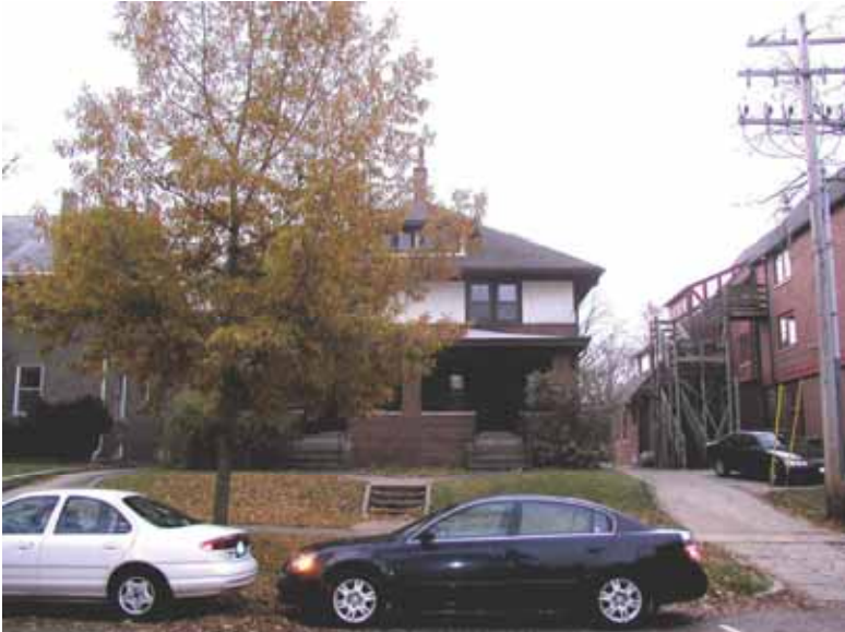
807/809 W. Indiana