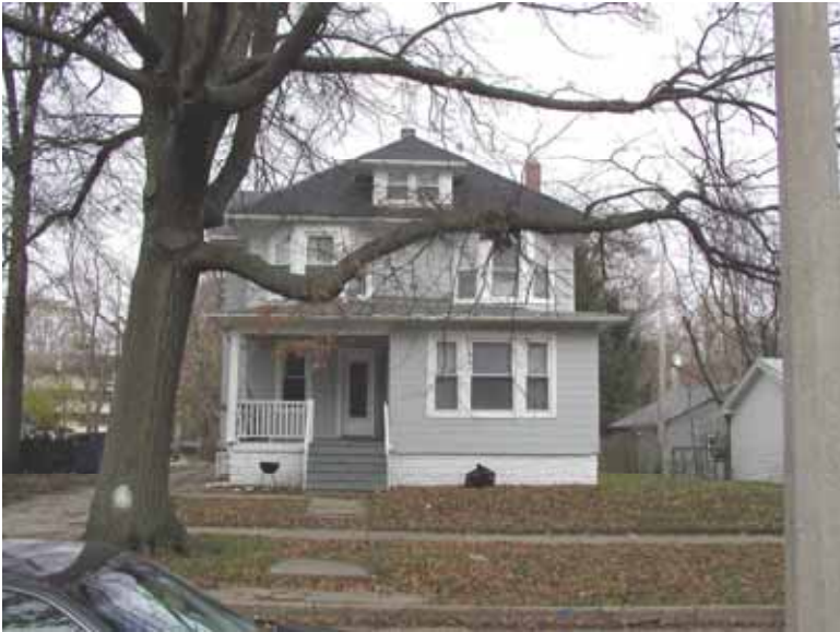
806 W. Ohio