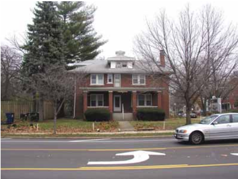
1008 S. Lincoln