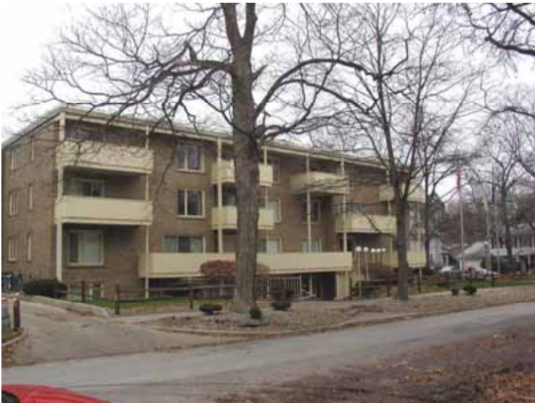
802 W. Oregon