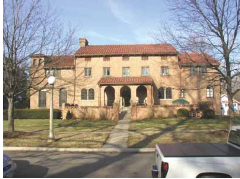
706 W. Ohio