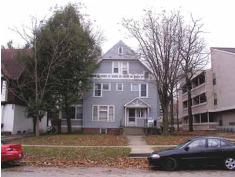
805 W. Oregon