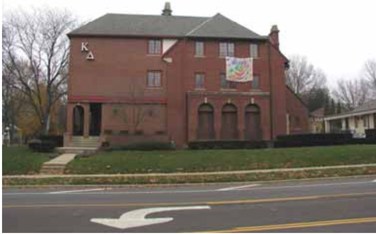
1204 S. Lincoln