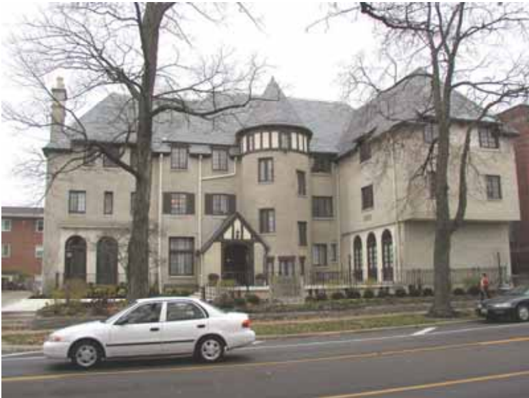
1106 S. Lincoln