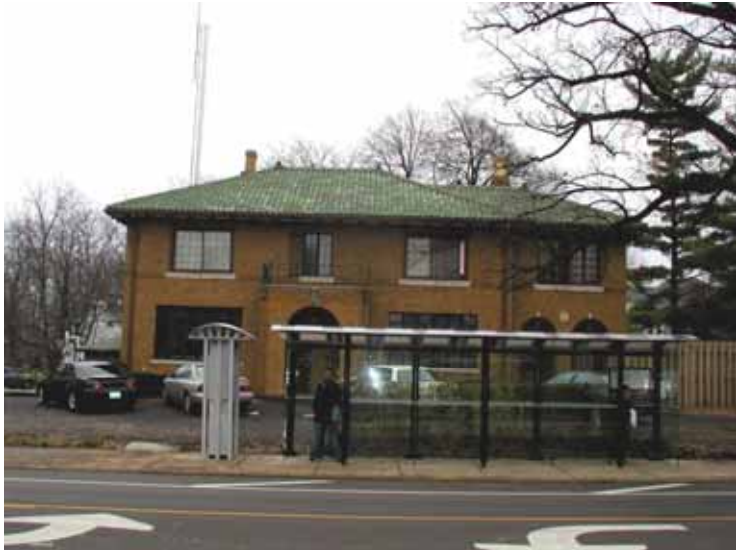
1004 S. Lincoln