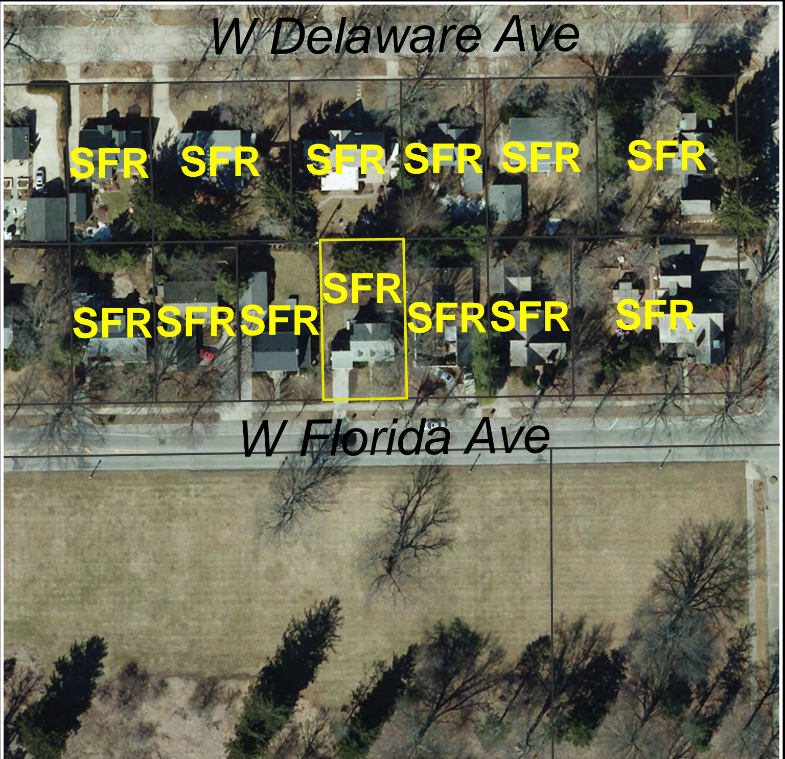
Exhibit A: Location & Existing Land Use Map