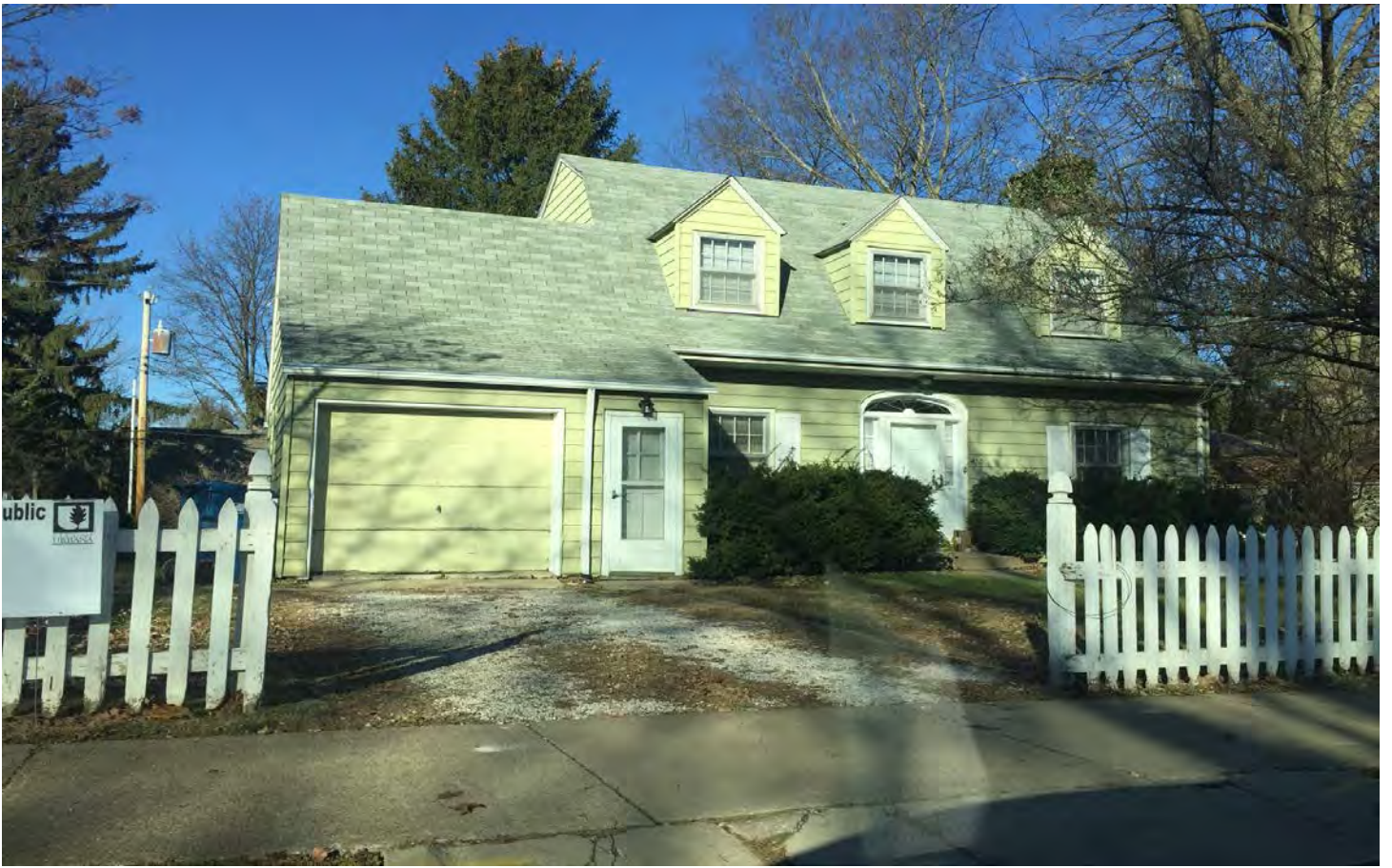
116 W. Florida