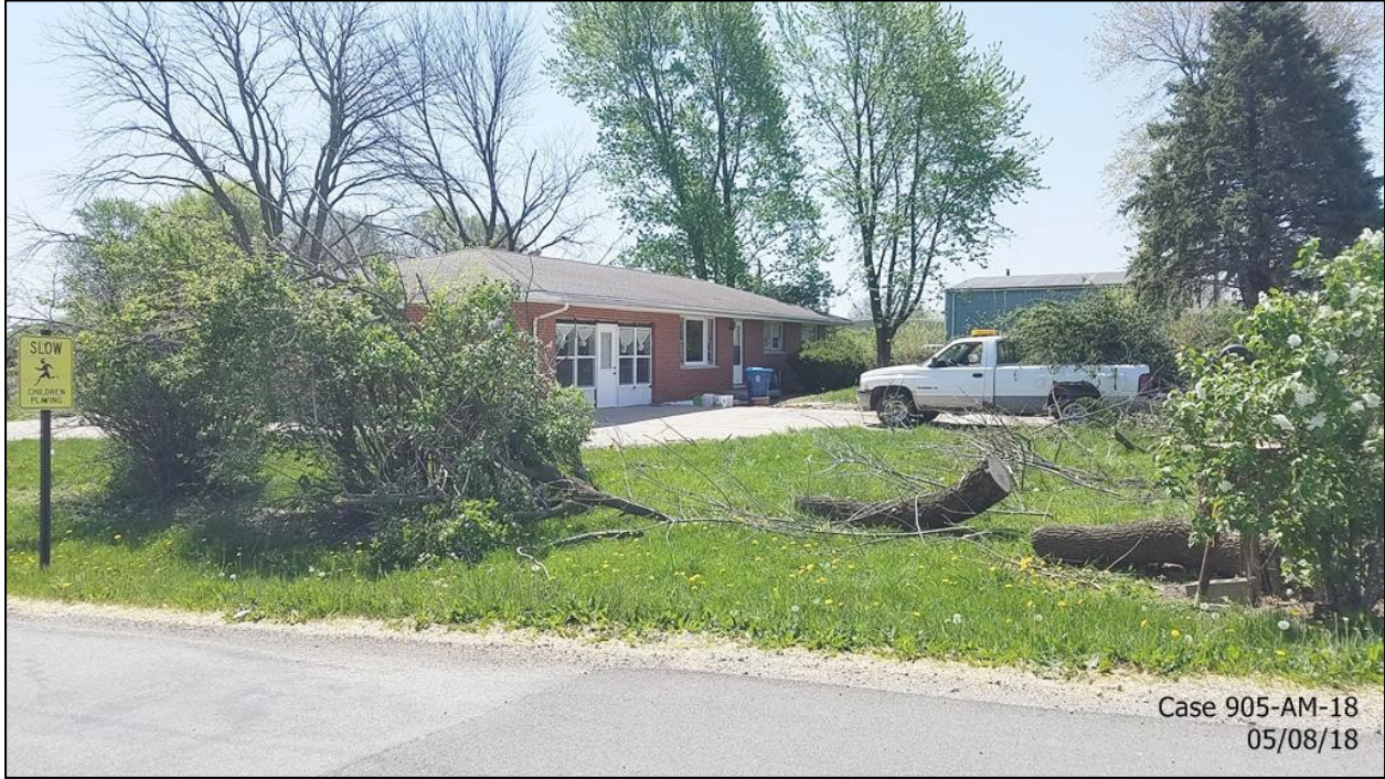
From East Oaks Road at US45, facing SE