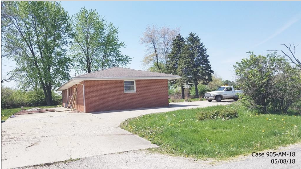
From East Oaks Road, facing SSW