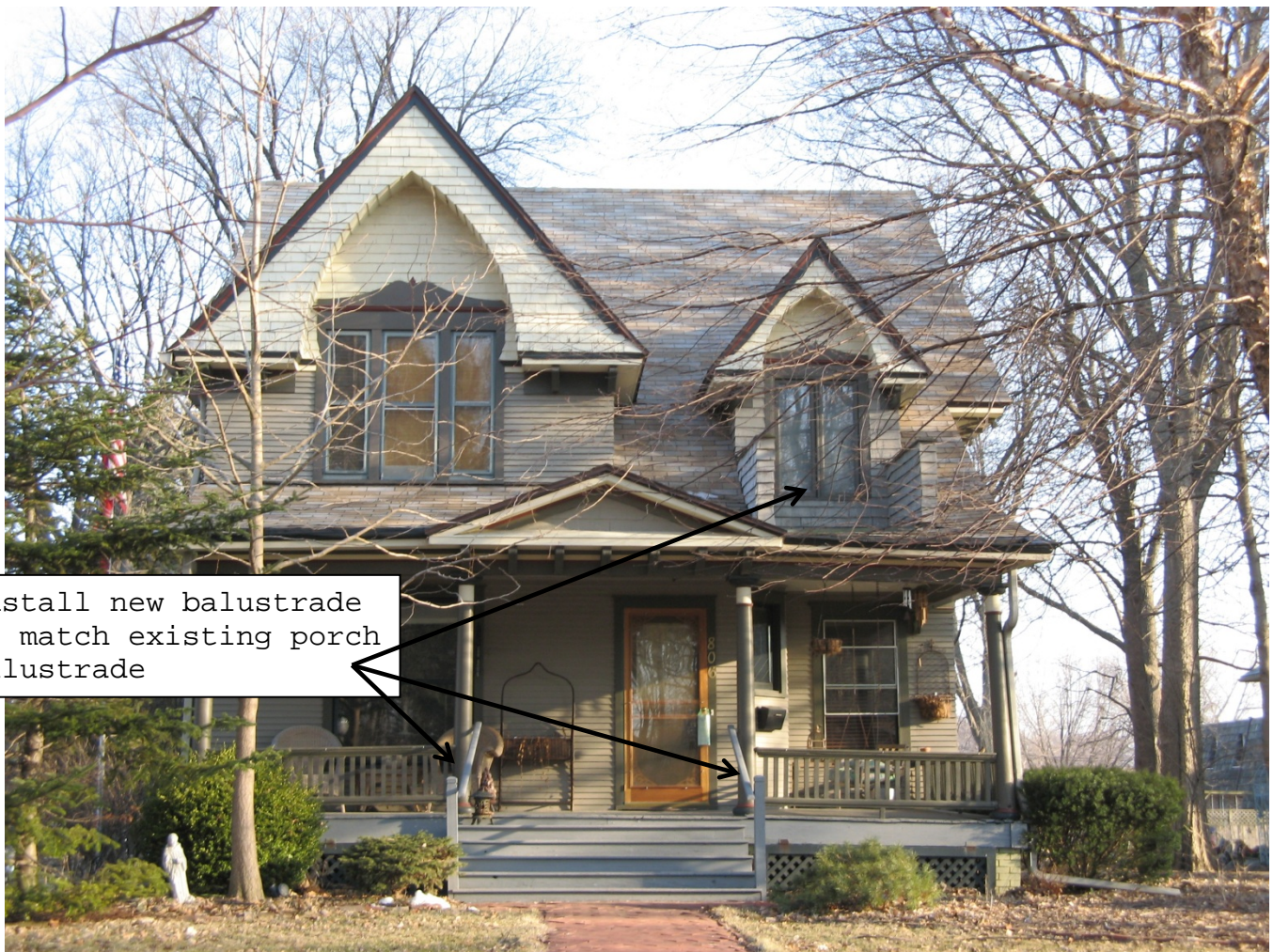
806 W Main Street. Photo taken in 2007.

The second component of the application is to install a balustrade on the second-story balcony on the front façade. The balcony does not currently have a balustrade. The applicant would like to install a balustrade for safety reasons. The balcony balustrade would be identical in design and materials to that on the porch and porch steps.