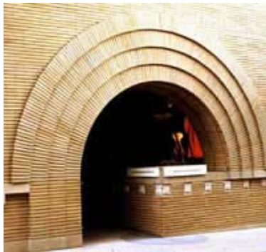
Entrances and porches are quite often the focus of historic buildings, particularly on primary elevations, such as this dramatic brick archway on an early 20th century building.

Identifying, retaining, and preserving entrances and porches--and their functional and decorative features--that are important in defining the overall historic character of the building such as doors, fanlights, sidelights, pilaster, entablatures, columns, balustrades, and stairs.