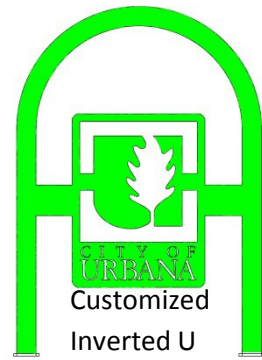
Customized Inverted U