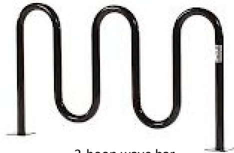
3-hoop wave bar