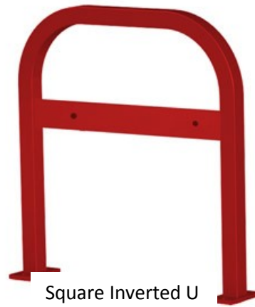
Square Inverted U with lean bar