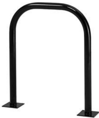
Square Inverted U