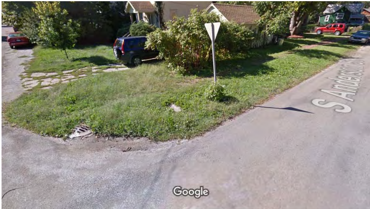
Picture of Brick Sidewalk on Anderson Street at High Street looking North