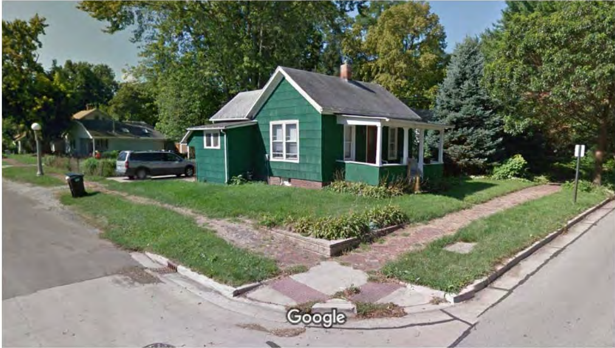
Picture of Brick Sidewalk on Anderson Street at Green Street looking South