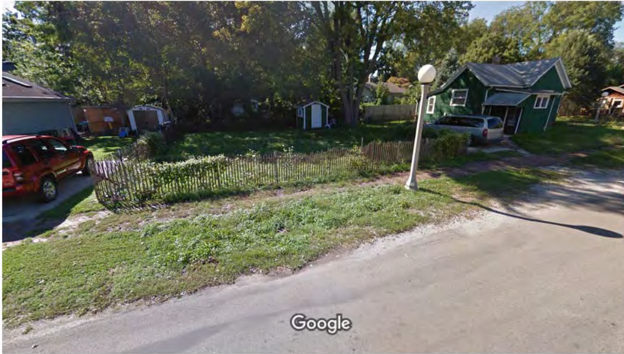
Picture of Brick Sidewalk on Anderson Street Mid-Block between High and Green Streets