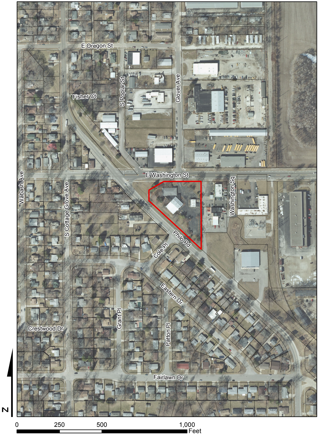
Exhibit B: Property Location Map -1301 E Washington St