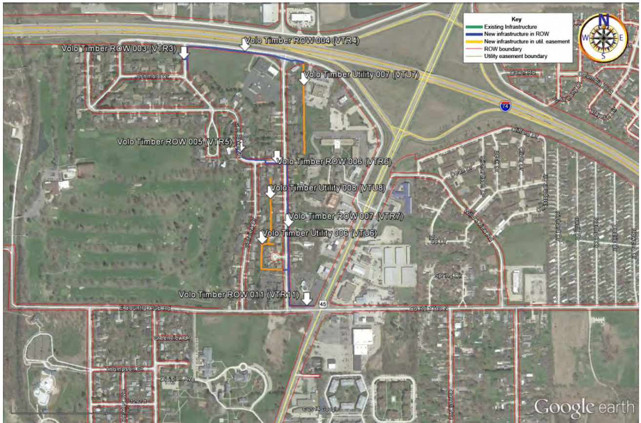
Exhibit F (July 21, 2014)