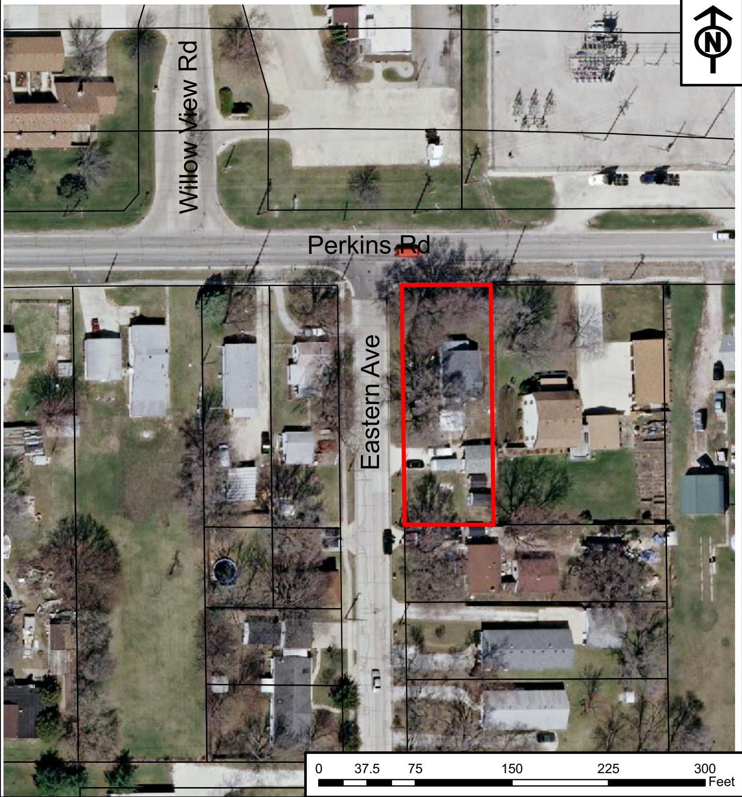
Exhibit A: Location Map