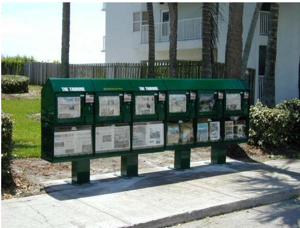
Approved news rack by Rak Systems, Inc.