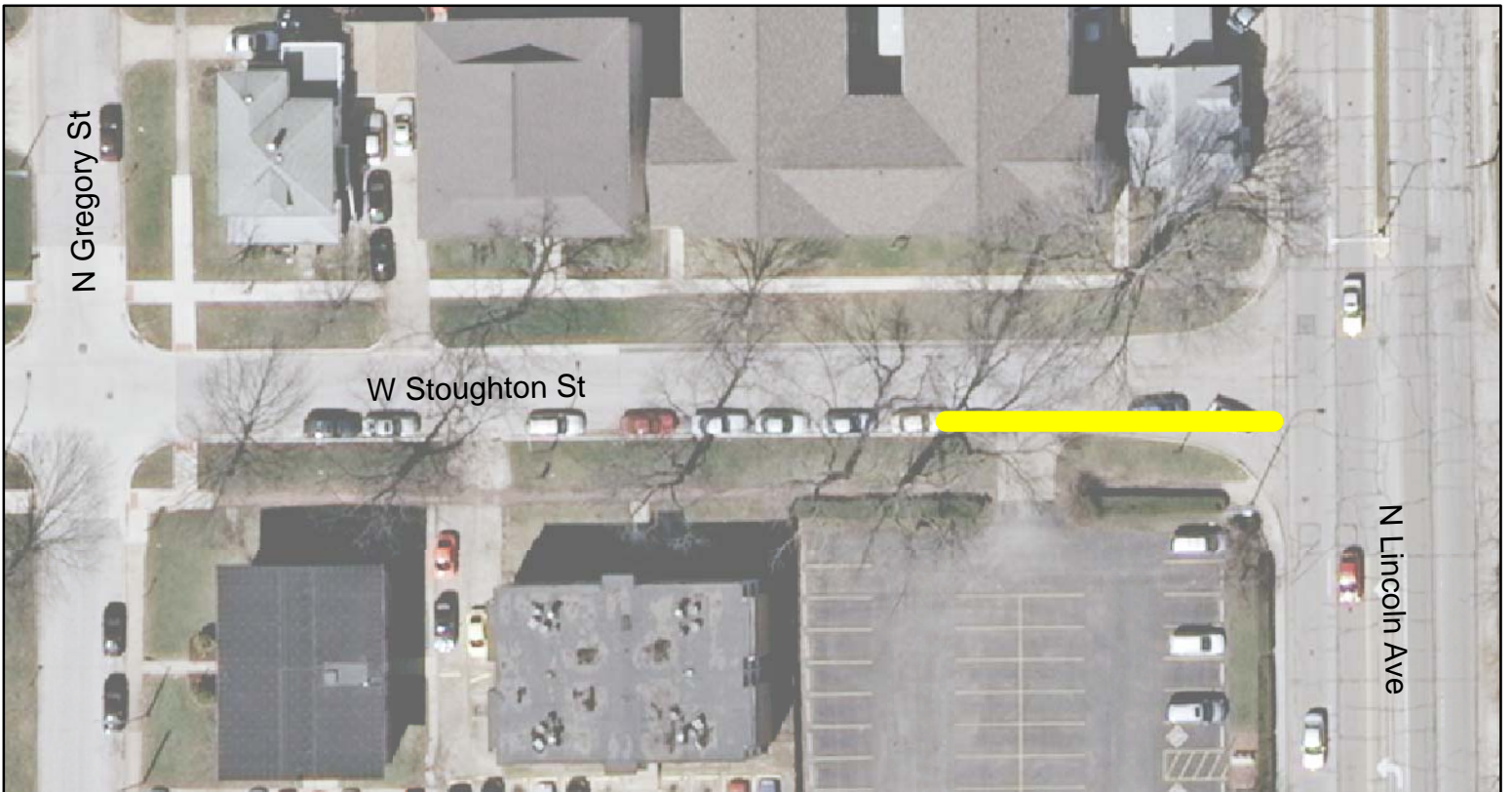
Proposed No Parking- Stoughton Street From 33 feet west of Lincoln Av centerline to 121 feet west of Lincoln Av centerline - south side of street.