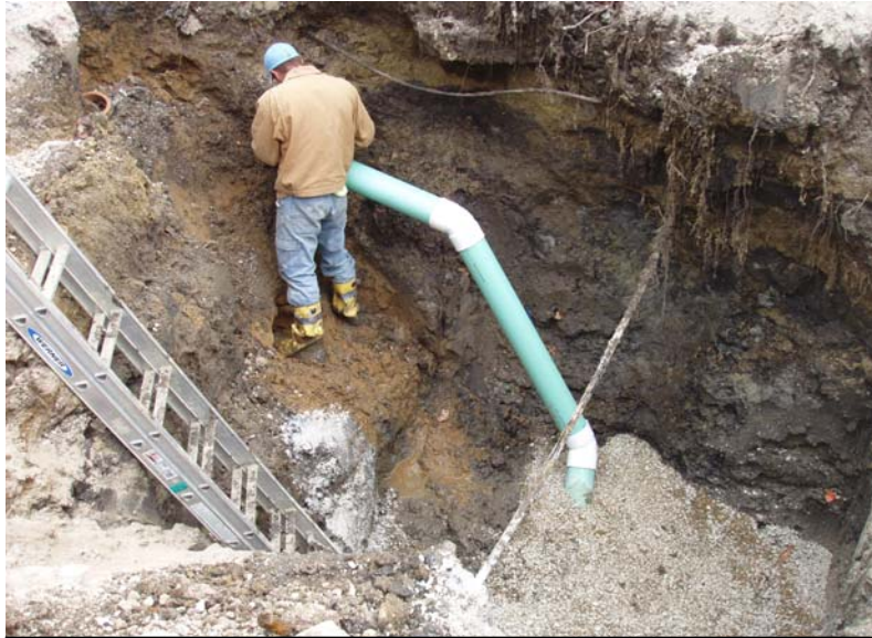
Photo of a typical sanitary sewer service lateral replacement.