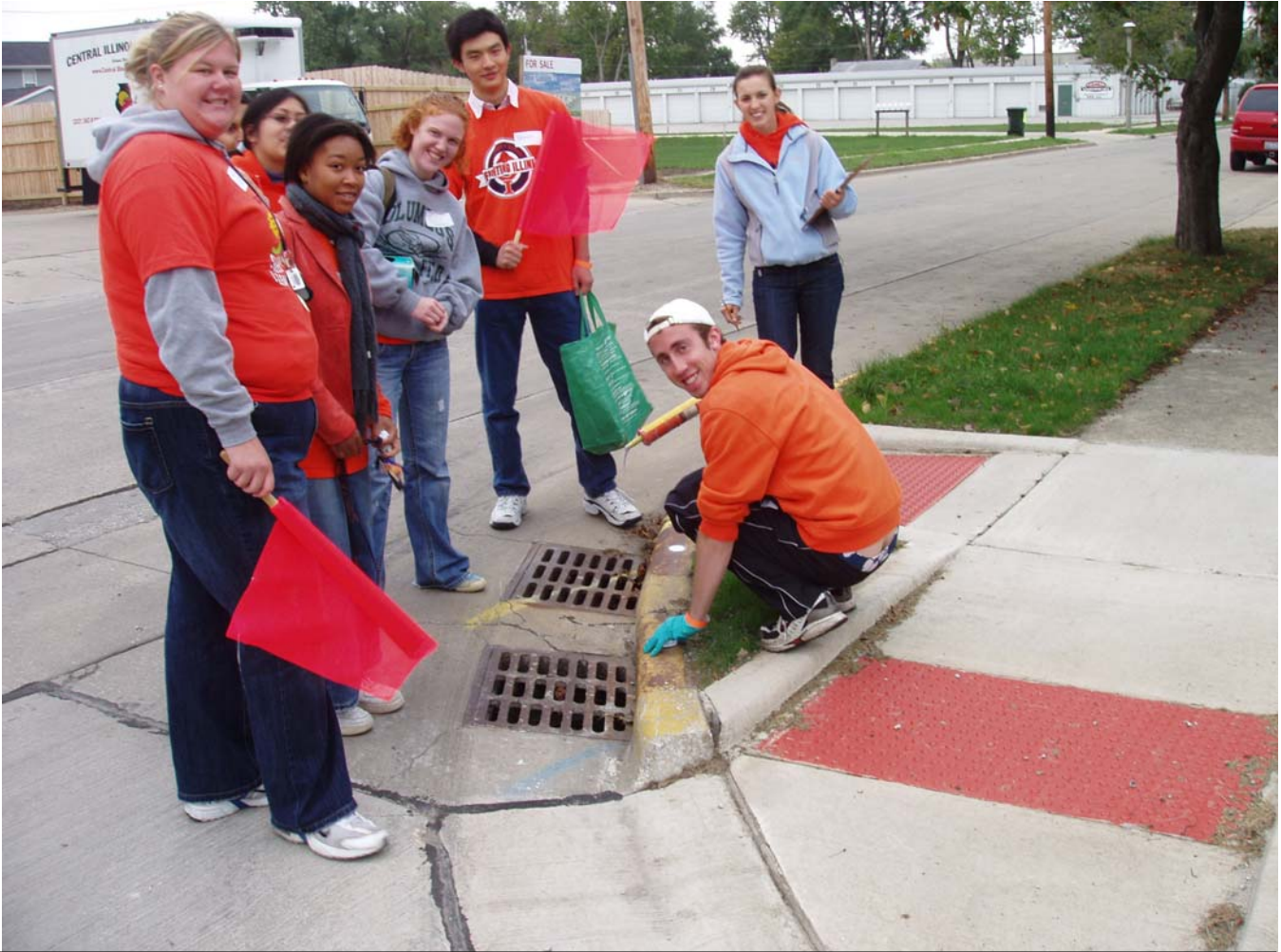
Storm Sewer Inlet Medallion Installation

ADMINISTRATION • ARBOR • ENGINEERING • ENVIRONMENTAL MANAGEMENT EQUIPMENT SERVICES • OPERATIONS • PUBLIC FACILITIES