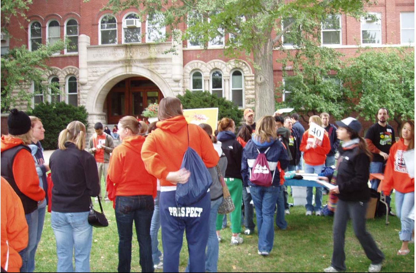
Registration at Quad

ADMINISTRATION • ARBOR • ENGINEERING • ENVIRONMENTAL MANAGEMENT EQUIPMENT SERVICES • OPERATIONS • PUBLIC FACILITIES