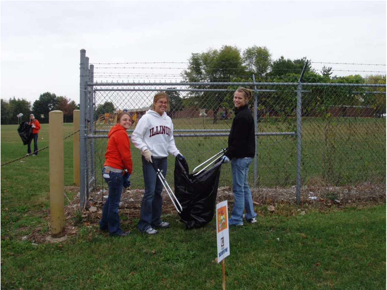
Litter Clean-up at Thomas Paine Site