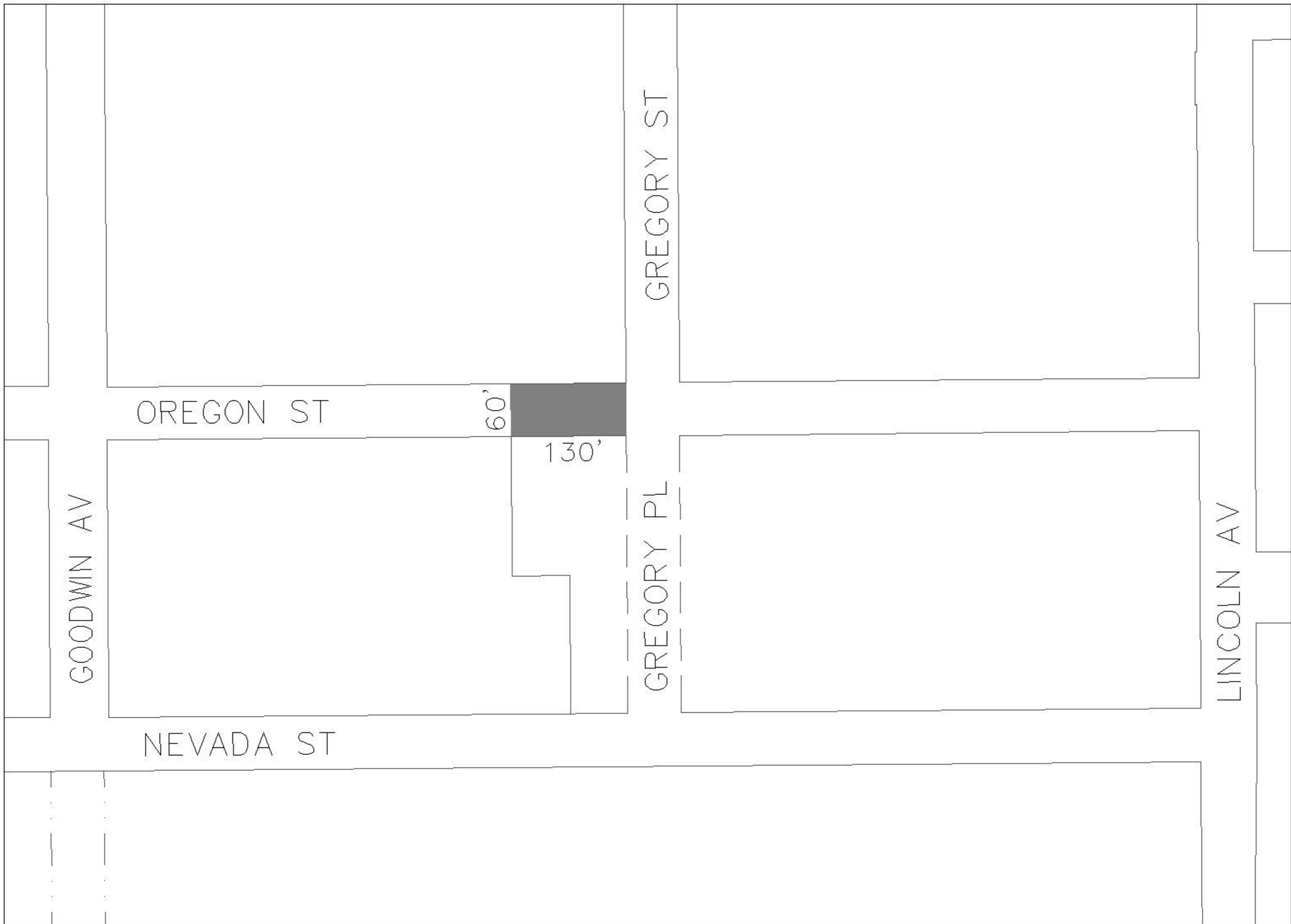
EXHIBIT A - Oregon Street