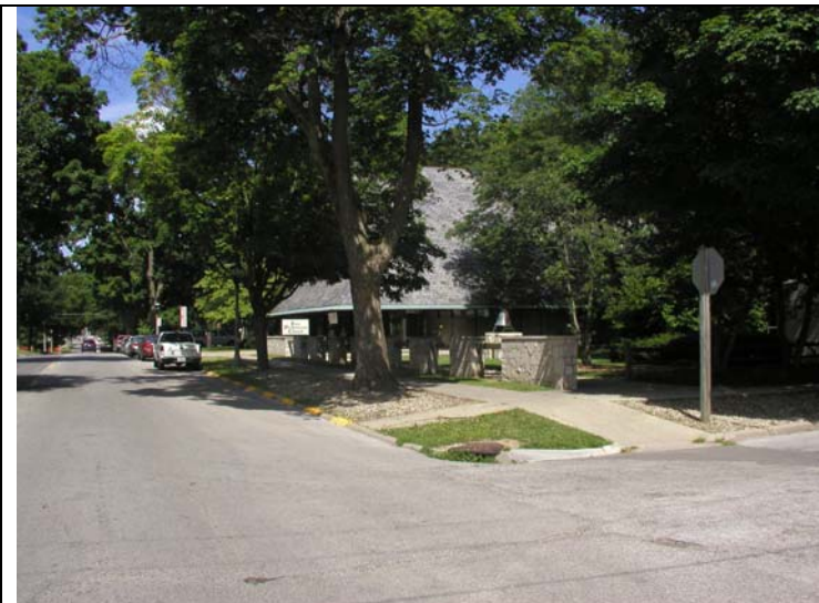
Facing west – traffic view