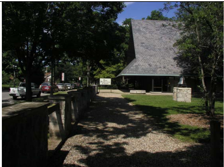
Facing east – traffic view