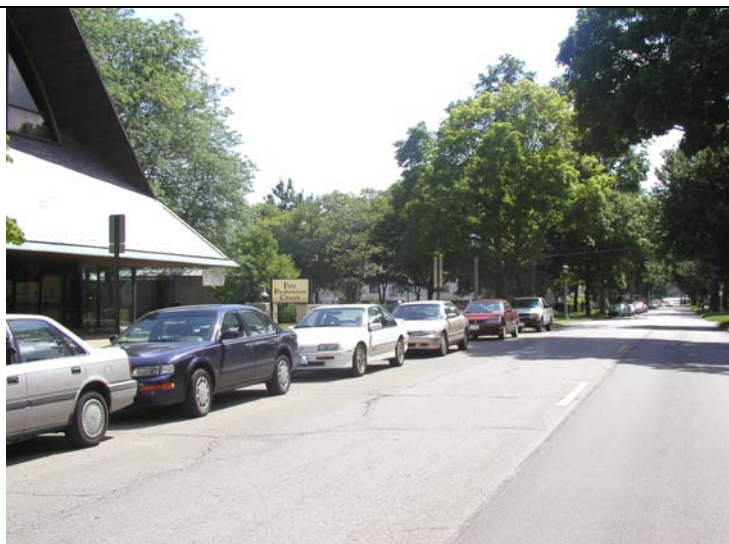
Facing east – traffic view