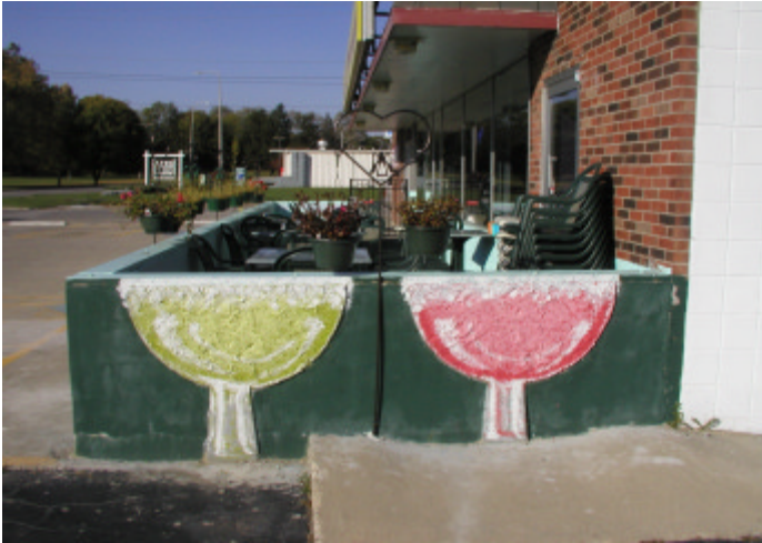
Patio Area - Looking North