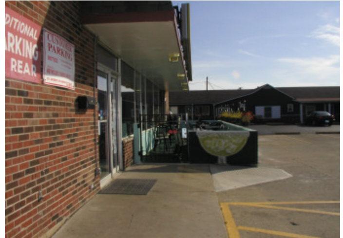
Patio Area-Looking South