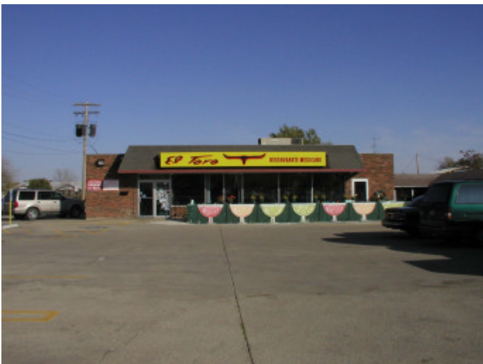
Subject Property Facing East