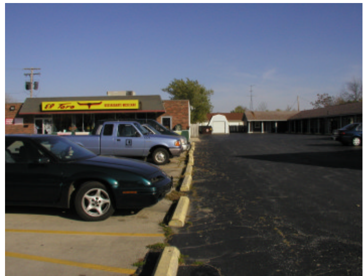
Southern Property Line-Facing East