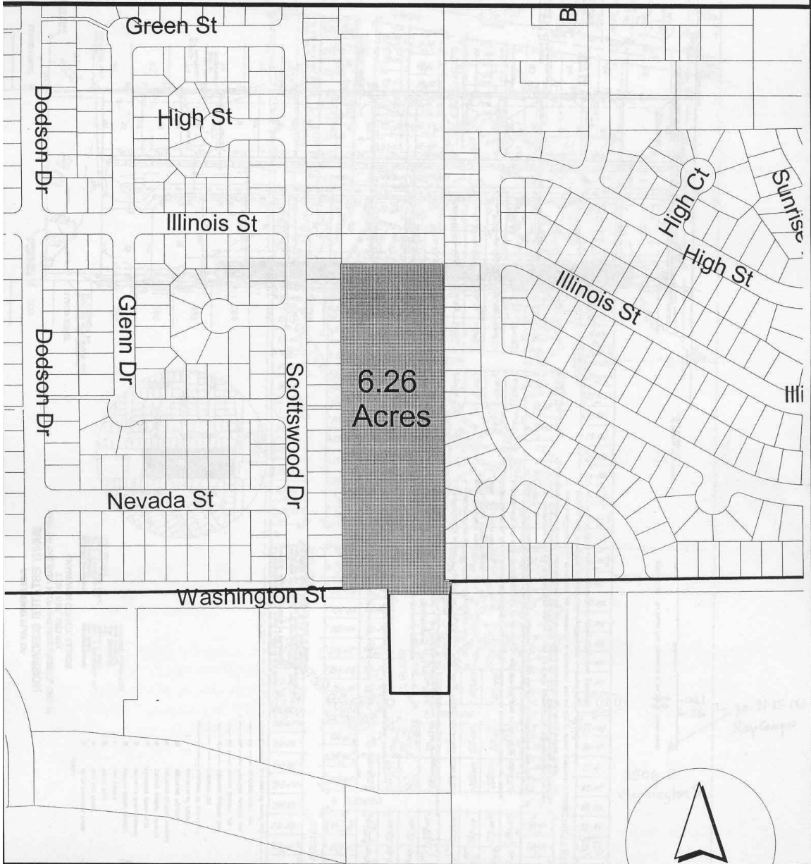
Exhibit "B": Location Map