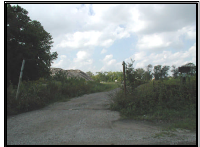
View looking west along access drive just north of 3107 N. Lincoln Avenue.