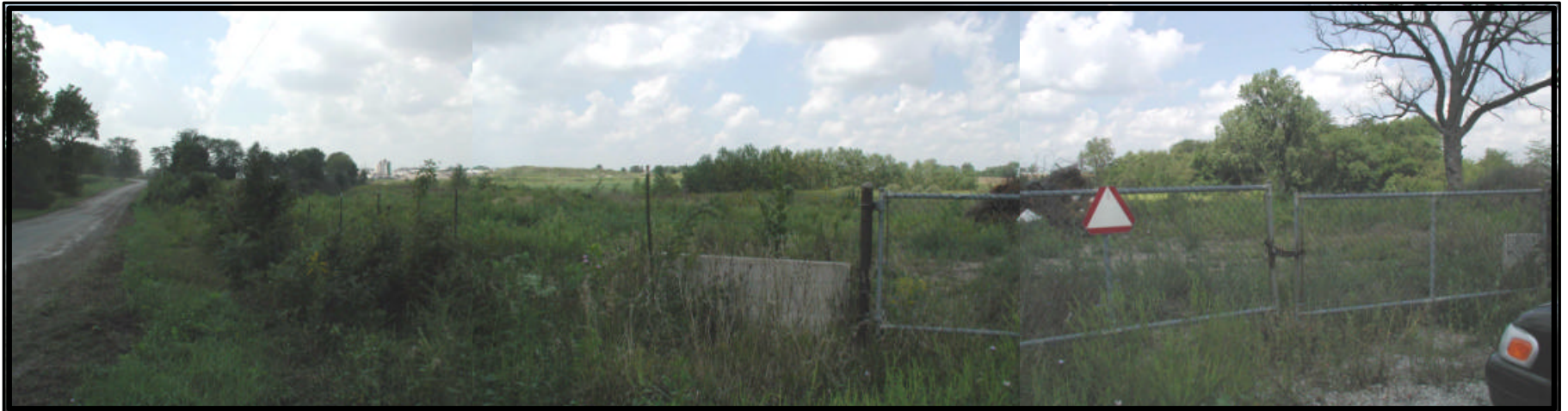
3301 N. Lincoln Avenue – Barber & Deatley vacant tract : View looking south to west. Lincoln Avenue (the “angle” that intersects with Oaks Road) is on left. Far left is Dunn Farm. At right is gated drive that is in City and leads to Saline Branch. A common location for illegal dumping has now been clean up and is under control. CN Railroad yards are at horizon.