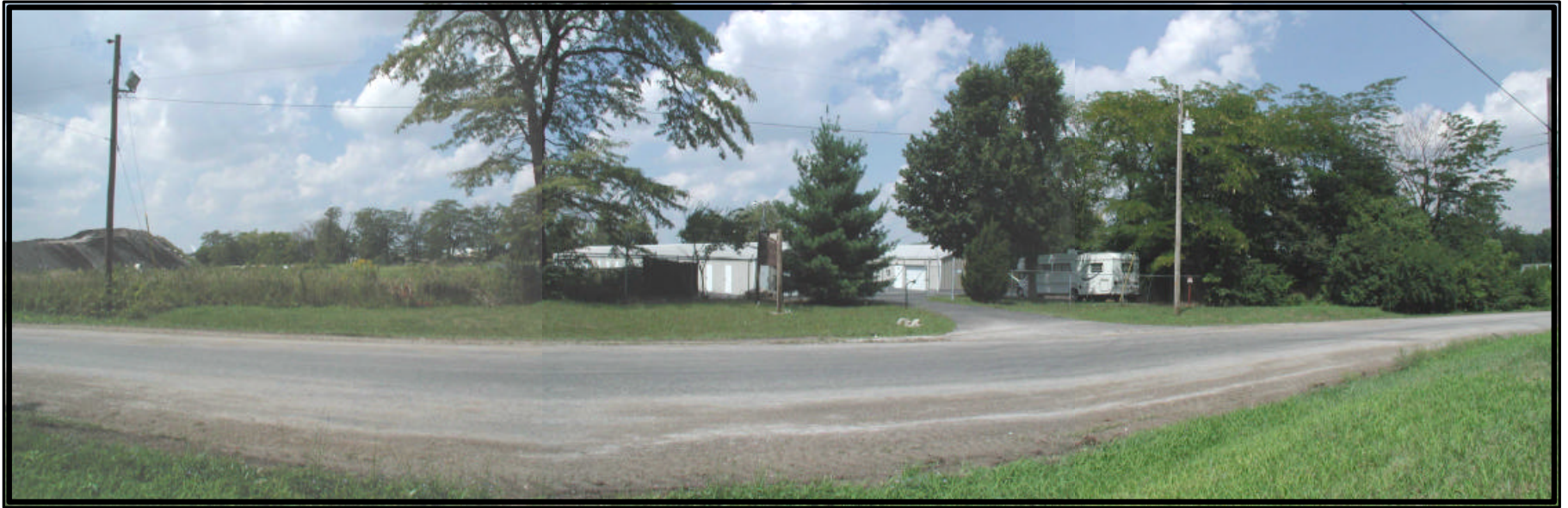
3201 N. Lincoln Avenue - Lincolnwood Warehouse Systems: View from Dunn Farm looking southwest to northwest across Lincoln Avenue. At left is storage area for recycled concrete. At right is future extension of Lincoln Ave. over Saline Ditch.