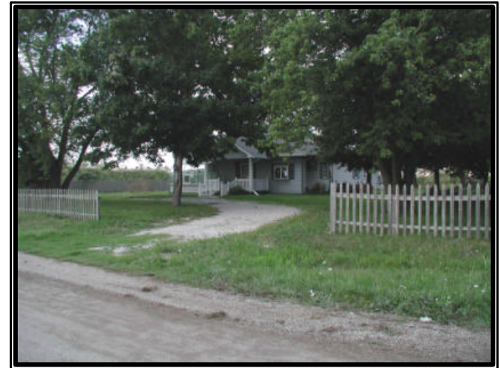
View looking southwest at 3107 N. Lincoln Avenue, a single family residence.